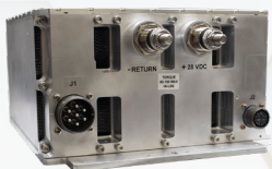
1-STEP AC-DC Converter